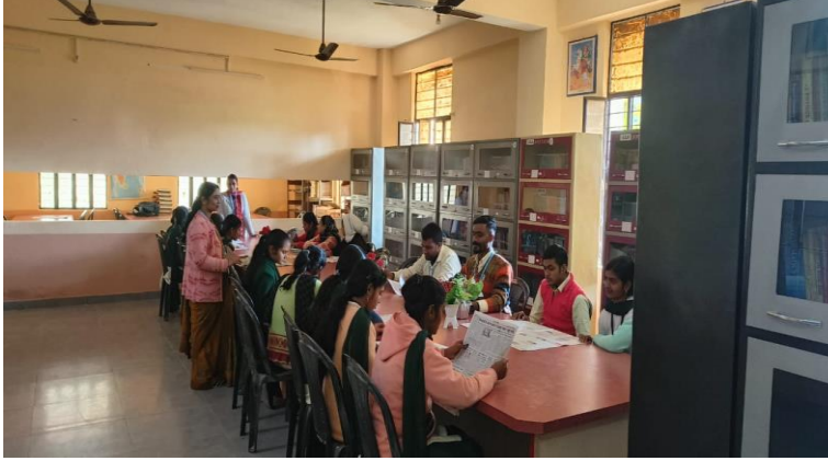
Mentor teacher taken the suggestions for Journals and competition magazine