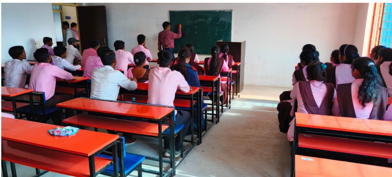
A Teacher's Insight into Language Across the Curriculum in Education Dated 20/05/2023

The Faculty Exchange Programme yielded several positive outcomes for both institutions. Firstly, it facilitated enhanced professional development opportunities for faculty members through exposure to diverse teaching methodologies and research collaboration. Secondly, it strengthened collaboration between Bhuvan Malti College of Education and Shyam Sai Institute of Education, laying the foundation for future joint initiatives and partnerships.