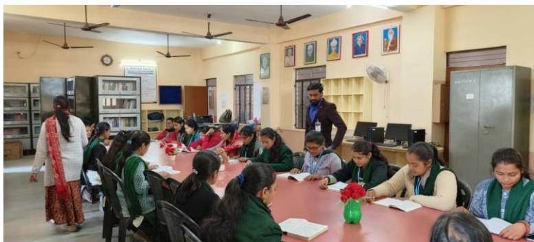
Mentor Teacher guided to the teacher trainee for Brainstorming date 2-1-2023