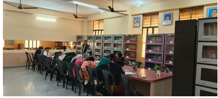
Student in Library Reading room on Guidance of Mentor.