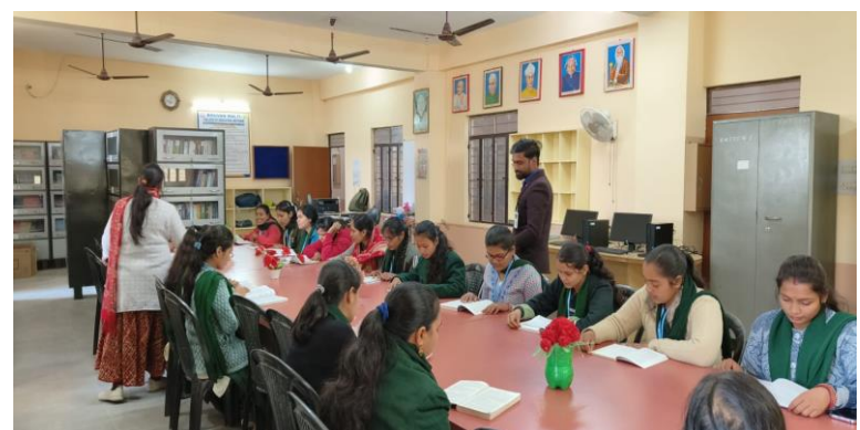
Mentor teacher taken the suggestions for Brainstorming and Suggested for new library books date 2-1-2023