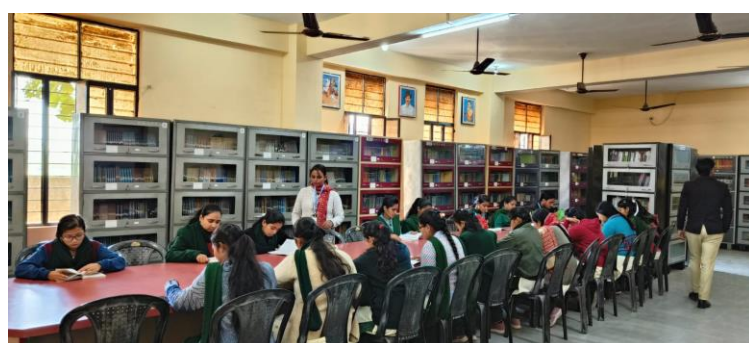
Mentor teacher taken the suggestions for library development date 2-1-2023