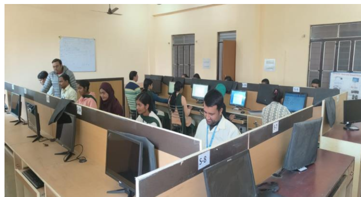
Knowledge in organic farming techniques and creative writing