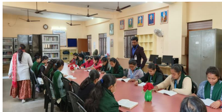
library development Committee taken ideas for library up gradation date 2-1-23