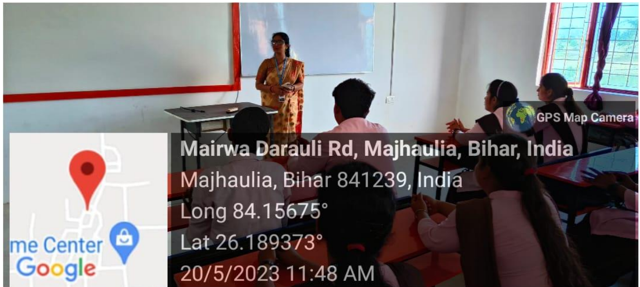
The Teacher Exploring Diverse Perspectives A Gateway to Insightful Exchanges and Idea Generation Dated 20/05/2023

Cultural exchange events were organized to promote mutual understanding and appreciation of each other's cultures, including cultural performances, traditional cuisine tastings, and visits to local landmarks.